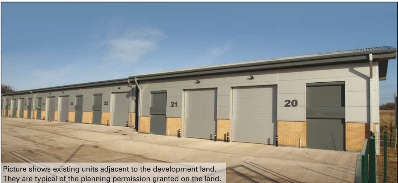
Picture shows existing units adjacent to the development land. They are typical of the planning permission granted on the land.

Limited availability on a strictly first come first served basis